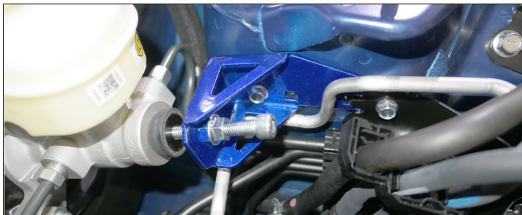
Illustration of installed state 安裝完成示意圖