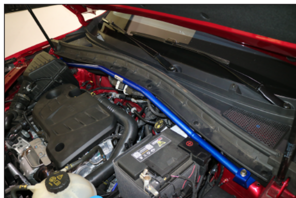
▶ Illustration of installed state 安裝完成示意圖