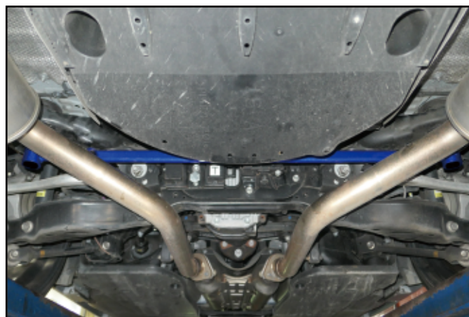
See figure 1 (參考圖表一)