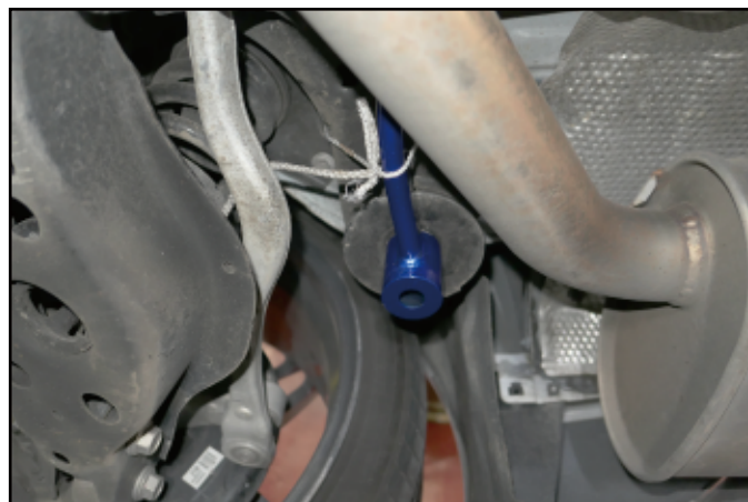
See figure 2 (參考圖表二)