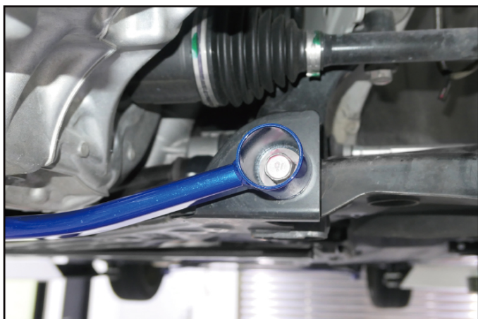
See figure 2 (參考圖表二)