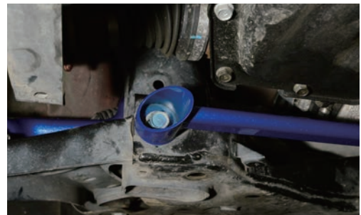
Illustration of installed state 安裝完成示意圖