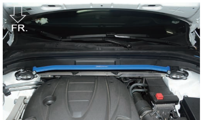
Illustration of installed state