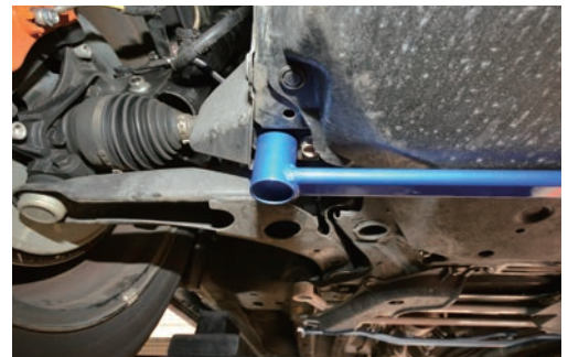
Illustration of installed state

將 ①結構桿桿身 組裝於車輛，並鎖上已拆下的原廠螺絲固定桿身。(請參考圖表二、三)