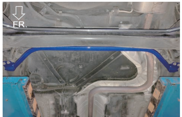
Illustration of installed state 完成示意圖