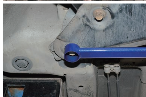
Illustration of installed state 完成示意圖