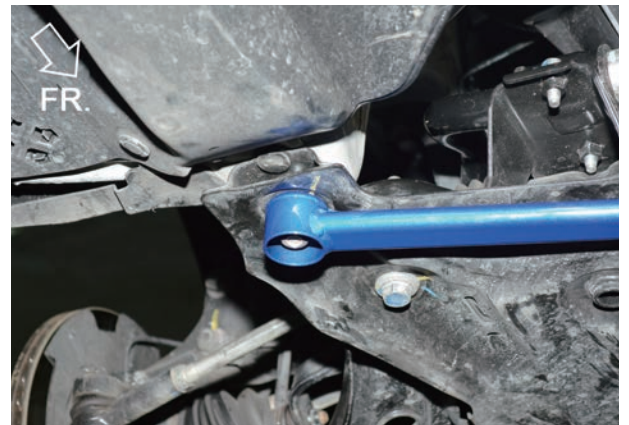
Illustration of installed state 完成示意圖