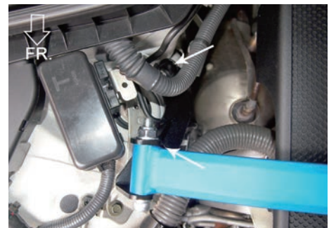
Illustration of installed state 完成示意圖

拆卸駕駛座側最靠前方及最靠外側的螺帽，並將引擎室拉桿另一端置於避震塔，最後將螺帽鎖回避震器上座。(請參考圖二)