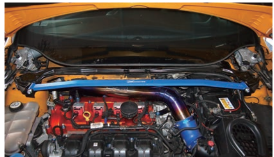
Illustration of installed state. 完成示意圖