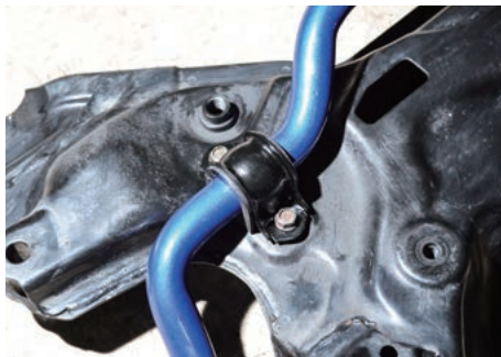
Dedicated stabilizer bush and bracket. 專用橡皮及C型固定座

※ Removal of front cross-member is suggested for easier installation. 更換防傾桿，建議拆卸前樑方式安裝