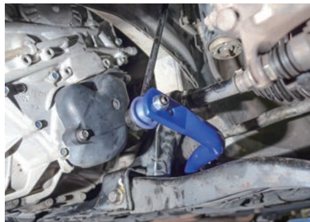
Stiffness adjustable 可調軟硬